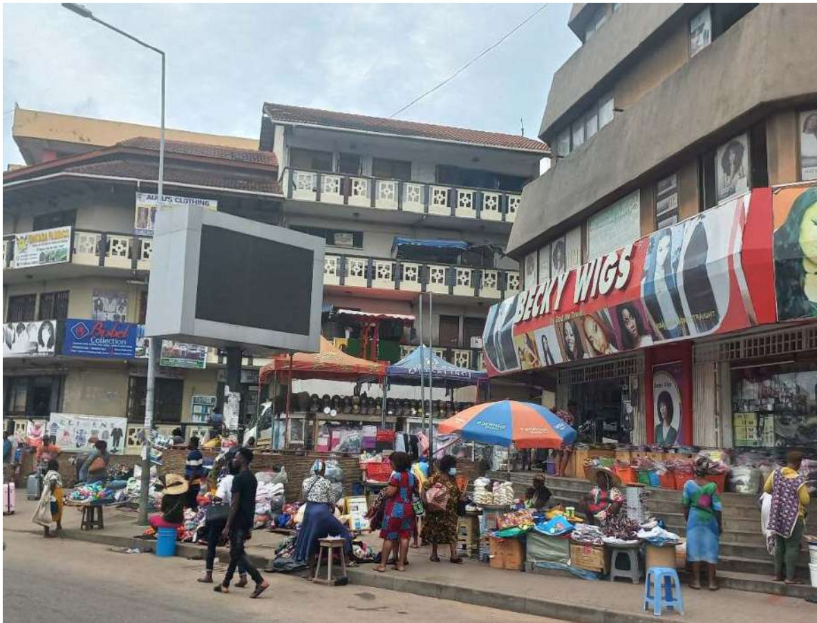
Fig. 2: Makola Shopping Mall hiɛ.

Ye neke akpo kuku nɛ mli le wɔ hara niamlitaomɔ ni kɔɔ he tɛ ke eba akpo gbetsinii ye jarayeli hei nɛ. Klɛɣklɛɣ fa le tsɔ nagbai komɛi ni kɔɔ tseɣemɔ hela kudumɔ gbetsinii ke nitsumɔ ni ake kpe ye jaji ete niamlipɛimɔ ni yɔ Kumasi ke Accra. Nii ashishi numɔ kpakpa ni kɔɔ gbetsinii pɔtɛ nɛ he le haa aleɔ gbei ni esaake ako ketsu wɔsɛ saji ahe nii. Nɔni ji enyɔ le jeɔ ɣaawoo ete ni atsɔ nɔ anaa hiɛyaa ye kɔɔyɔ hela hewalewoo ye jarayeli hei le akpo.