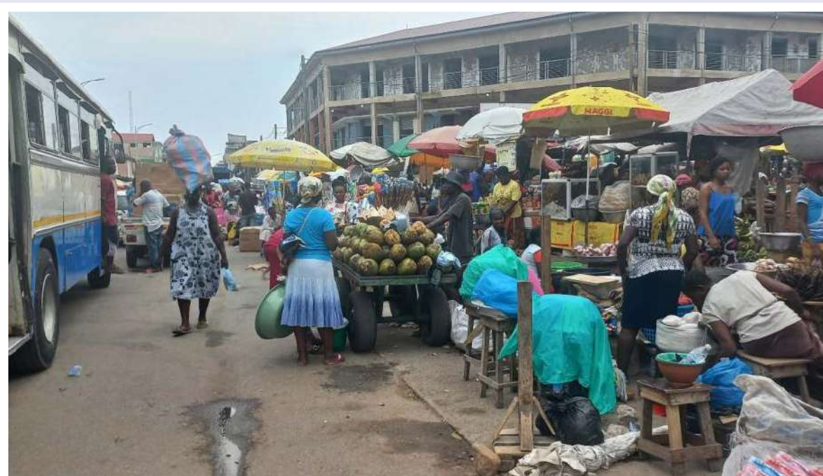
Fig. 3: Guɔyɛlɔi ni miya nɔ oyayai yɛ 31st December jara lɛ mli

De falefale – kɛtsɔ de fɔmɔ be fɛɛ be kɛ/aloo tsɔfai kɛhad Ɔhand sanitizerƐ– ji gbe kome ni ato he gbejianɔ ni yɛɔ omanyɛ ni haa abaa COVID – 19 kɛ tɛɛɲmɔ helai srotɔi ni gbɛɔ eshwaa lɛ shi. Be mli ni de falefale feemɔ he bahia yɛ be mli ni COVID-19 kɔɔɔɔ hela je ehia kpɔAs hand hygiene became critical in the wake of the COVID-19 pandemic, jarayeli he nɔkwɛlɔi ni yɔ Accra and Kuɔ masi fee nibii ni bayɛ ebuɔ de fɔmɔ ni ji Veronica buckets – ni nu yɛ mli – ni samina nu fata he kɛ de tso fa (hand sanitizers). Nɛkɛ falefale feemɔ he nibii ni akɛhaa lɛ je ankroankroi, blema tɛmɛi anɔkwɛlɔi (traditional authorities) kɛ nitsumɔhei kpanaa (corporate institution) aderɲ. Keji nibii nɛɛ ni akɛha ta, abɛ shika jɛɛhe ni akɛ baahe nɛkɛ falefale feemɔ he nibii ni akɛ tsuɔ nii yɛ jarayeli hei nɛɛ. Agbɛnɛ hu akɛ guɔyɛlɔi efeko gbejianɔtoo ko ni abaaha amɛ falefale feemɔ he nibii nɛɛ ni amɛkɛ tsuɔ nii yɛ jara lɛ mli. Shwapo awalɔi, nii terɛlɔi kɛ trɔke tsilɔi hu nuu he akɛ esani amɛkɛ nu awo Veronica buckets bei fɛɛ bei. Kɛfata he hu, de fɔmɔ gbejianɔtoo, yɛ bei pii amlɔi, ba shi yɛ otsi fioo komei asɛɛ ni nyiɛ ekenitsumɔ yɛ jarayeli hei ni yɔ Accra kɛ Kumasi.