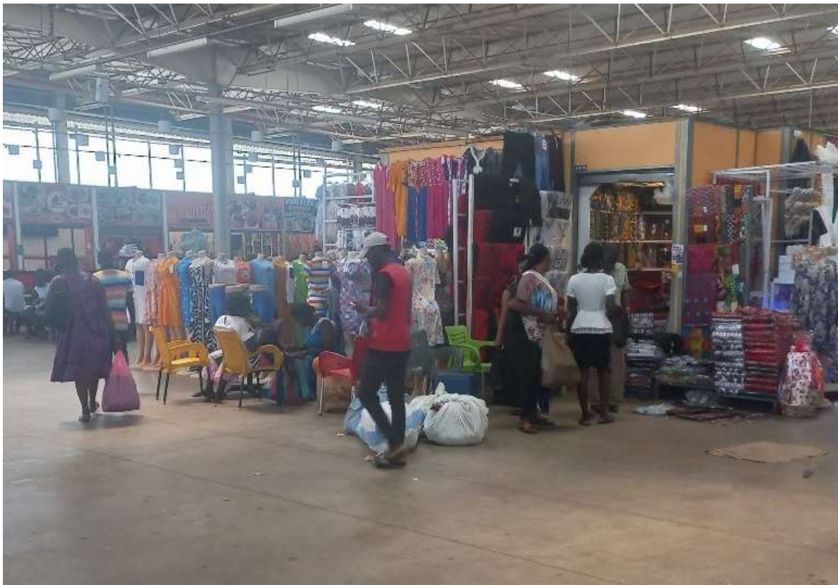
Fig. 5: Nihomɔ ni yaano oyayai ye 31st December jara le mli

Ye be mli ni jeɗ fɛe gbɛjianɔtoo ye tseremɔ helai akudumɔ le ni eye omanyɛ ni ake mli tsu nii ye hei babao, ehe miihia ni maɗ fe maɗ ahara gbɛ ni hi keha ame shihile. Ye no najian ni abaa ɗamɔ jarayeli hei nɛe aloo atsake mei abe ni amɛke baaya nitsumɔ koni no aha ake he aka shra ye jarayeli hei nɛe ni mei babao tsuɔ nii ni wolo kaa he ni ame wala damɔ daagbi nihomɔ shika ni ame feo no, esani jarayeli nokwɛlɔi ke ame hewale awo falefale feemɔ he nibii ni ame baato he gbɛjianɔ ye jarayeli hei nɛe ketsɔ hetsemɔ hieyaa ke kooɔ mli tsofa ni abaashi (fumigation) be fɛe be. Lɛɛɛɛ, deɗ fɔmɔ he gbɛjianɔtoo ke daa kooɔ mli tsofai ni abaashi (fumigation) ji gbɛi ni yoo mlɛo ni ake baatsu ni moɗ fe mei ni ake shraa he gbɛjianɔtoo. Neke gbɛi nɛe baa nagbaai ke nitsumɔi ke shika shihile keha jarayeli nitsulɔi shi, titrii le kuu ni amɛbe hewale. Noni ataoɔ ji nitsumɔ tsemɛi ahe tiumɔ ye nibii ni amɛbaaha ni bawaje falefale feemɔ ni akebaatsu nii.