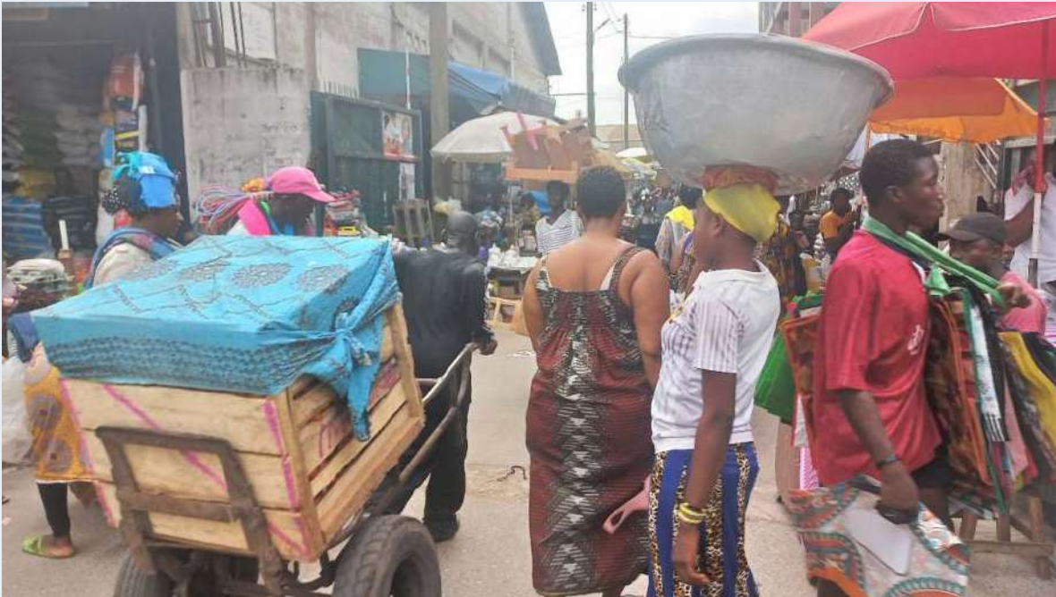
Fig. 6: Trɔke tsilɔ ni eke amɛmɔ mlɔi ha yɛ 31st December jara lɛ mli

nutsulɔi kɛ akutsei fɛɛ. Be mli ni niamlɔtaomɔ nɛɛ tee nɔ yɛ Ghana, ena tɛɛɛɛmɔ hela kudɔmɔ anɔkwɛmɔ yɛ jarayeli hei krokomei ni yɔɔ West Africa maji mli.