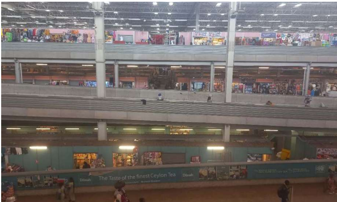
Fig. 4: ɲweitsu ni ahɔɔ nibii sɔtoɔ yɛ mli yɛ Kejetia jara ni yɔɔ Kumasi tɛɲ lɛ

waa, esani nɔkwɛlɔi abɔ mɔdɛɲ ni eha mafɛɛ mɔ arɲmala woji ni amɛkɛ ha, titrii lɛ nitsumɔ bibii kɛ ewuji fɛɛ, ni atsu he nii ni aha amɛ shika pɛpɛɛpɛ. Nitsumɔi ni yɔ Ghana, my babaoɔ ji mɛi ni kɛ nibii haa ni ahɔ yɛ jarayeli hei, ni amɛ baanye amɛfee pii kɛtsɔ nitsumɔ lɛ sɔ ni ka amɛnɔ yɛ amɛkɛ shramɔ mli yɛ ekolɛ nibii ni amɛ kɛ baaha guɔyɛlɔi aloo ni amɛ baa tɛɛ nibii anɔ aloo ni amɛ baafi (anɔkwayeli) guɔyɛlɔi asɛɛ kɛ heyeli shika be mli ni kɔɔyɔ helalɛ ba. Guɔyɛlɔi akuu baanye hu ni amɛfi amɛ kuu mli bii asɛɛ kɛtsɔ shika ni ato kɛha mɛi ayeli kɛ buamɔ nɔ.